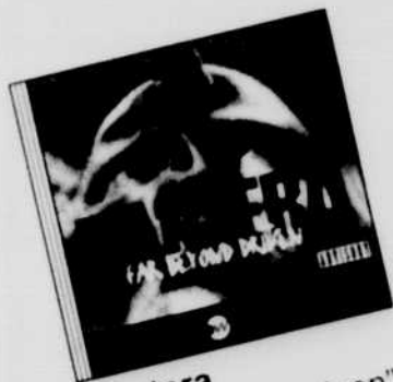
Pantera "Far Beyond Driven"