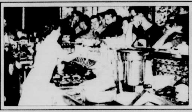
FROM THE PAST: The EMU had dances and activities for students (above) on Friday afternoons during the 1950s and 1960s in the Fishbowl. Long before the TacoTime Express, the EMU catered students with a full soda and ice cream bar (left).