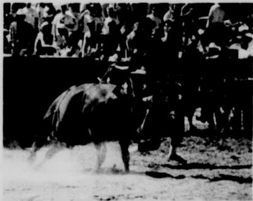
DEXTER LA GRAND, Auburn U. A rodeo clown full of bull at the Alpha Psi rodeo.