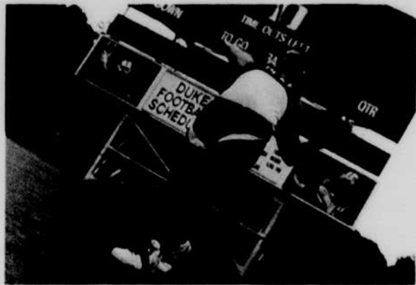
NICOLE PITTMAN, Duke U. "After a football injury, Gil Winters proves you can take the man out of a sport, but you can't take the sport out of the man."