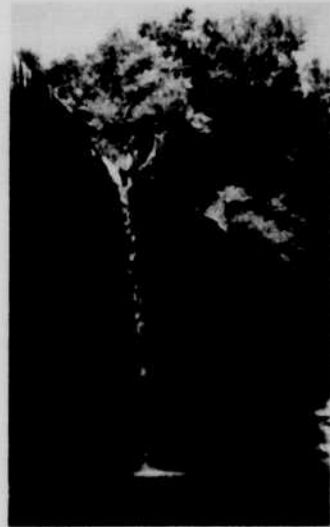
TIMOTHY DITTMAR, U. of Michigan "Jumping off a 76-foot waterfall in Lake Cumberland, KY."