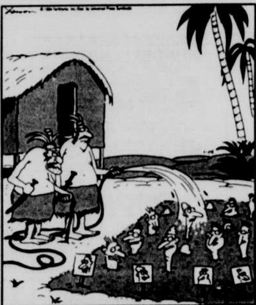
"This just makes me sick! ... Sick! ... Why, in my day, we collected wild heads from the jungle! ... These things are all steaks!"