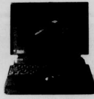
Apple PowerBook 145B 4/80 Only $1,296.

Introducing the Great Apple Campus Deal. Now, when you buy any select Macintosh* or PowerBook* computer, you'll also receive seven software programs. It's all included in one low price. And the software package alone has a combined SRP value of $596.* It was designed to