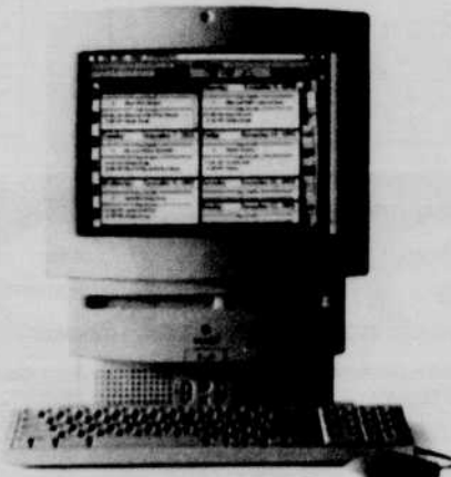
Macintosh LC 520 5/80, internal AppleCD™ 300i CD-ROM Drive, Apple Keyboard II and mouse Only $1,717.