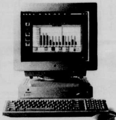
Macintosh LC 475 4/80, Apple Color Plus 14" Display, Apple Keyboard II and mouse Only $1,287.