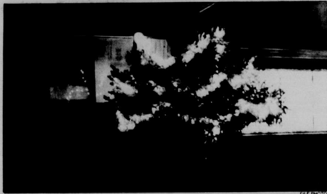
LTD's Joy Ride provides a unique view of the lights on the most beautifully decorated houses in Eugene.