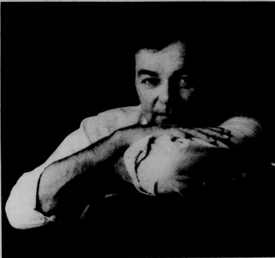
Mason Williams and friends and the Eugene Symphony Orchestra will perform songs from his newest album A Gift of Song at a concert in the Hult Center on Dec. 4.

The festive joys of Christmas and yuletide melodies have returned to Eugene bringing with them the second annual Mason Williams and Friends Hometown Holiday Concert with the Eugene Symphony Orchestra.