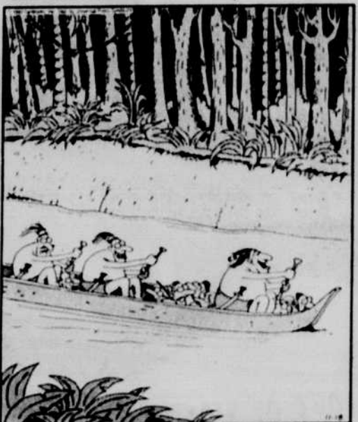
It had been a wonderfully successful day, and the dugout was filled with the sound of laughter and the fruits of their hunting skills. Only Kimbu wore a scowl, returning home with just a single knucklehead.