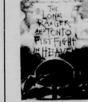
THE NEW BOOK BY SHERMAN ALEXIE

"ONE OF THE MAJOR LYRIC VOICES OF OUR TIME." —THE NEW YORK TIMES