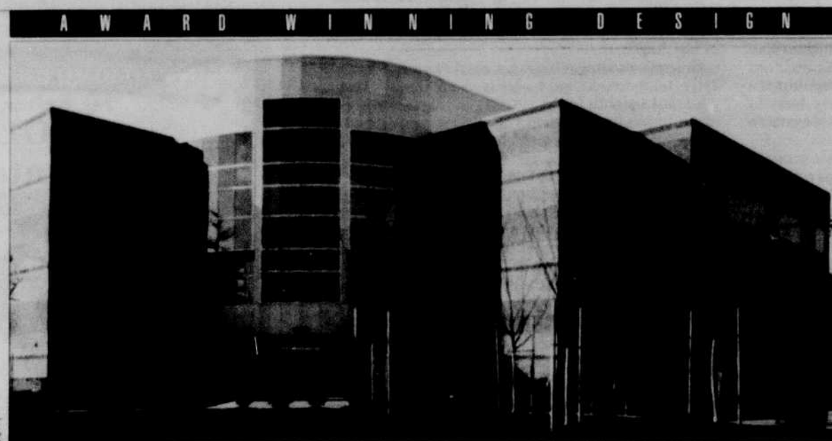
1600 MILLRACE DRIVE RIVERFRONT RESEARCH PARK