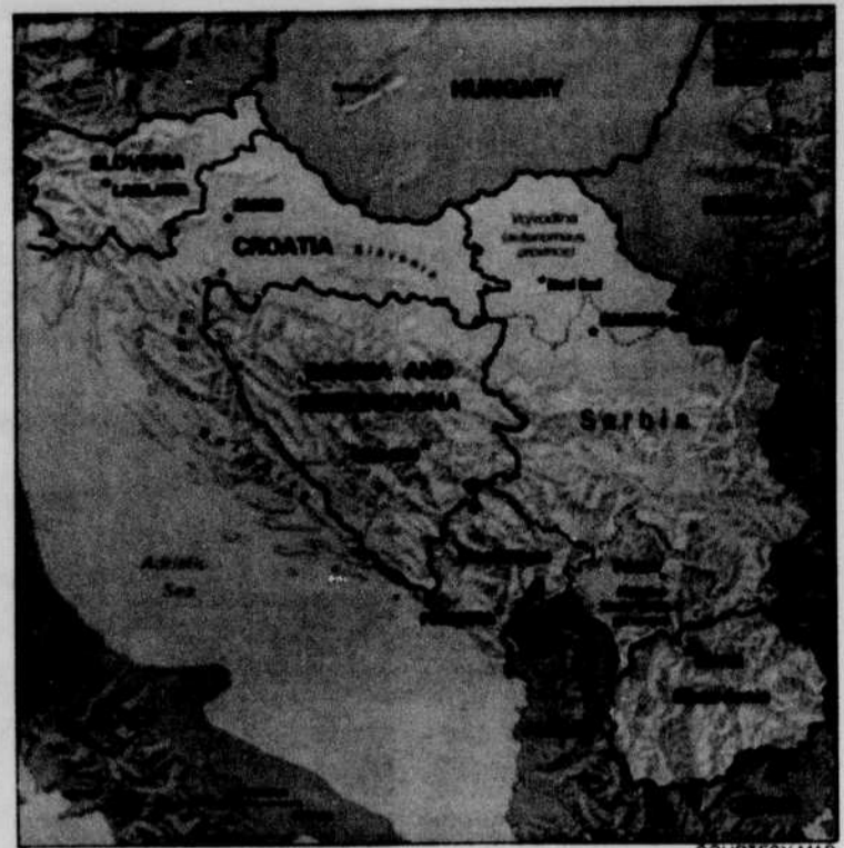
A map describing the area the writer visited.

She and her family spent one month in Muslim village. One day, a Serb who knew her family approached them and let them go back to Brcko secretly because