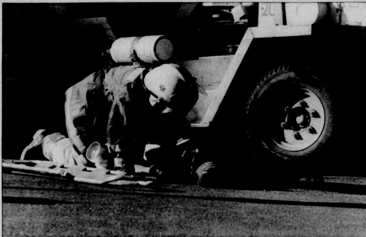
A rescue worker tends to the injured forklift driver who dumped flammable liquid during a drill at Onyx Bridge.

But that is what the drill was all about — to learn what needed to be done (and what needed to be done better) in a situation like this. Campbell said that overall, the