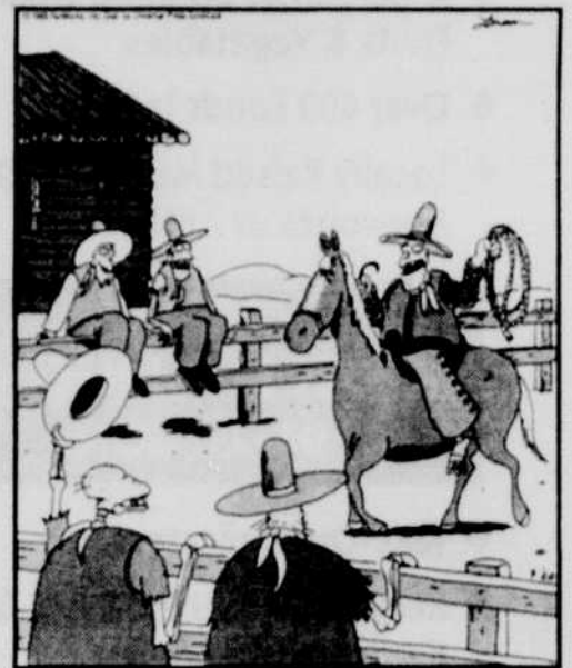
Vacationing from their jobs of terrorizing young teen-agers, zombies will often relax at a Western dead ranch.