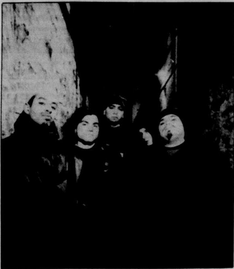
Shootyz Groove is a band that no one wants to run into in this alley.