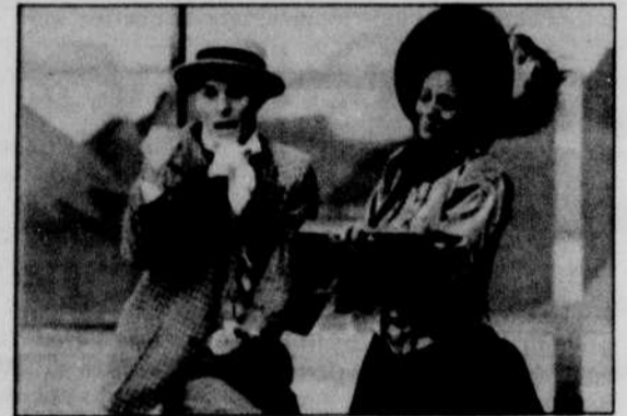
The Oregon Theatre Project takes to the stage for the first time tonight with a play about the Oregon Trail.

Set in the vast, forested wilderness along the Molalla River in the Cascades, the story revolves around a controversy where a land owner, after missing for 20 years, returns to sell the property that has been settled by pioneers. Fearing the loss of their homes, the settlers take matters into their