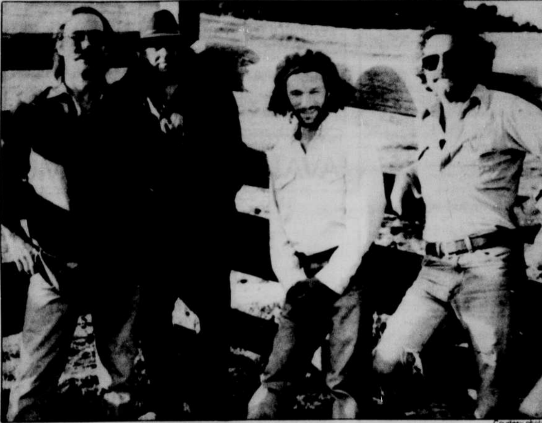
Zero will play the WOW Hall Saturday night at 9. Tickets are $8 in advance, $10 at the door.