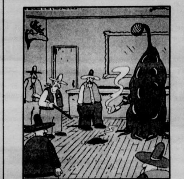
"Twarn't the alien's fault, sheriff... 'Ol' Jeb Halloway kept stickin' his head in one of the critter's orifices and yellin', 'Jimmie crack-corn! Jimmie crack-corn!'"