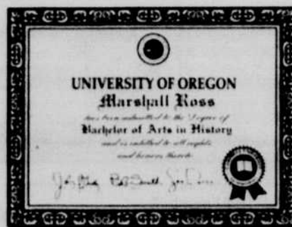
A DEGREE COOLER.