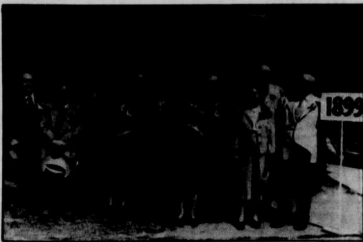
The class of 1899, pictured here in 1896, 1939 and 1949 (top to bottom) was one of the first to wear caps and gowns during commencement.