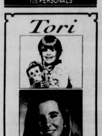
You've come a long way! Congratulations on Graduation! From Your Loving Family