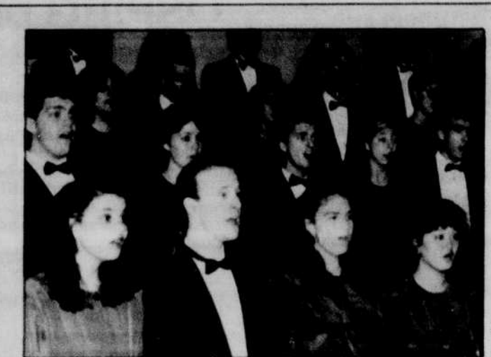
University Singers, the University's premier choral ensemble, performs Wednesday, June 2, in Beall Concert Hall at 8:15 p.m.

The music begins at 9:30, and admission is $5.