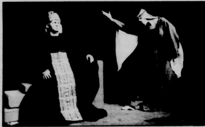
King Lear, the season's final University Theatre production, ends June 5.