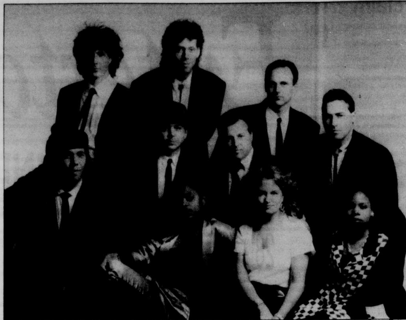
Body and Soul performs at Good Times Saturday night, bringing a healthy dose of Motown rhythm and soul to the house.

• Tuesday-Thursday, 3 p.m. - dusk • Friday, 2 p.m. - dusk • Sat. & Sun., 10:30 a.m. - dusk on the mill race 1395 Franklin Blvd. 346-4386