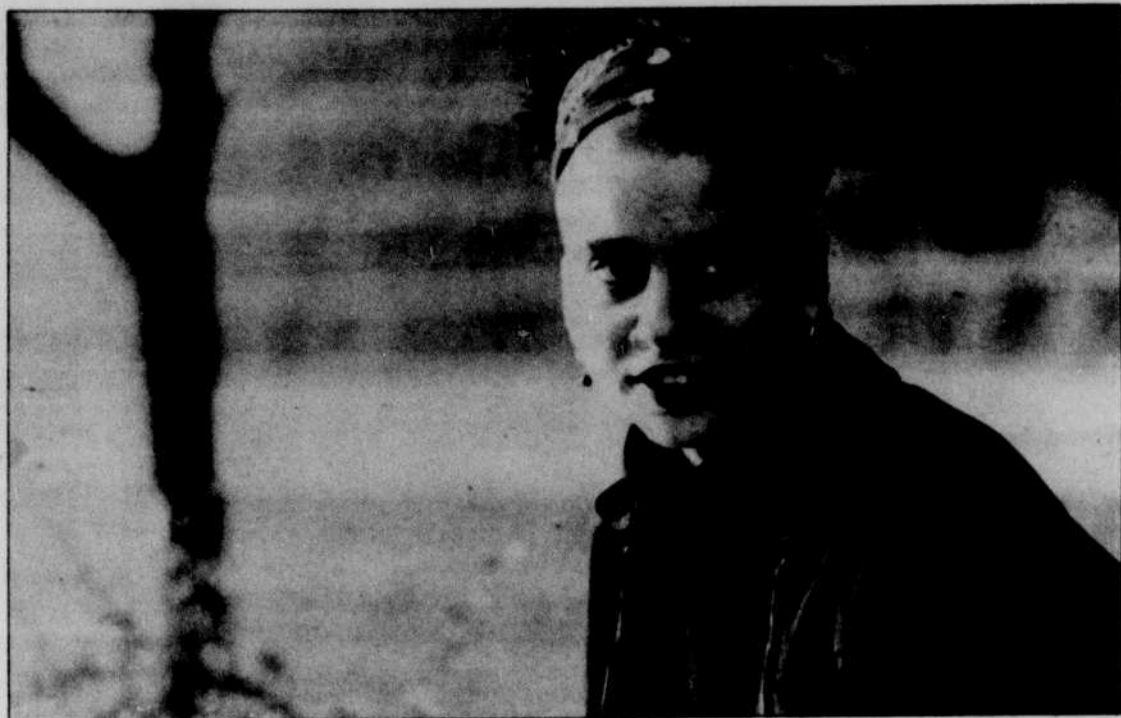
Ani DiFranco, who has been called one of the most powerful feminist musicians of our century, will perform Friday, May 21.