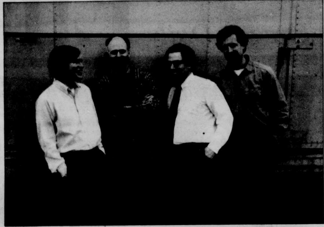
Oomph!, a band that features "Jewish party music gone haywire," will add its touch to the folk festival.