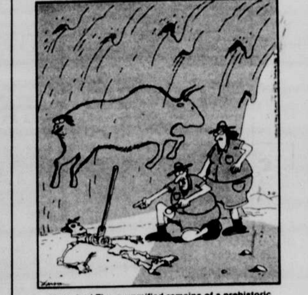
"Amazing! The mummified remains of a prehistoric cave-painter — still clutching his brush! ... Seems he made an enemy, though."