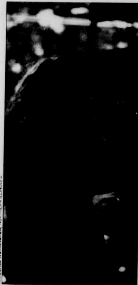
KIMBERLE WETHINGTON, NORTHERN ILLINOIS U. Eddie Vedder of Pearl Jam at Lollapalooza '92 at Alpine Valley, Wisc.: Lots o' hair, lots o' flannel, lots o' guitar.