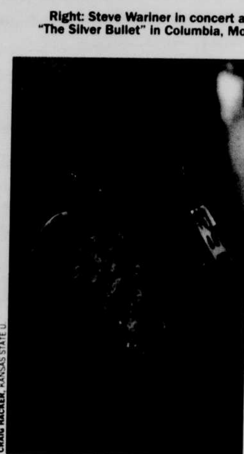
Garth Brooks pours his hat and soul into a show at Kansas State U.