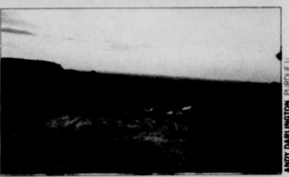
ANDY DARLINGTON, PURDUE U. Purdue U. students hang out in the Grand Canyon.