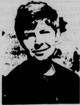
Robin Morgan Editor-in-Chief Ms. Magazine

Thursday, April 29, 1993 Erb Memorial Union The Ballroom 3:00 p.m.