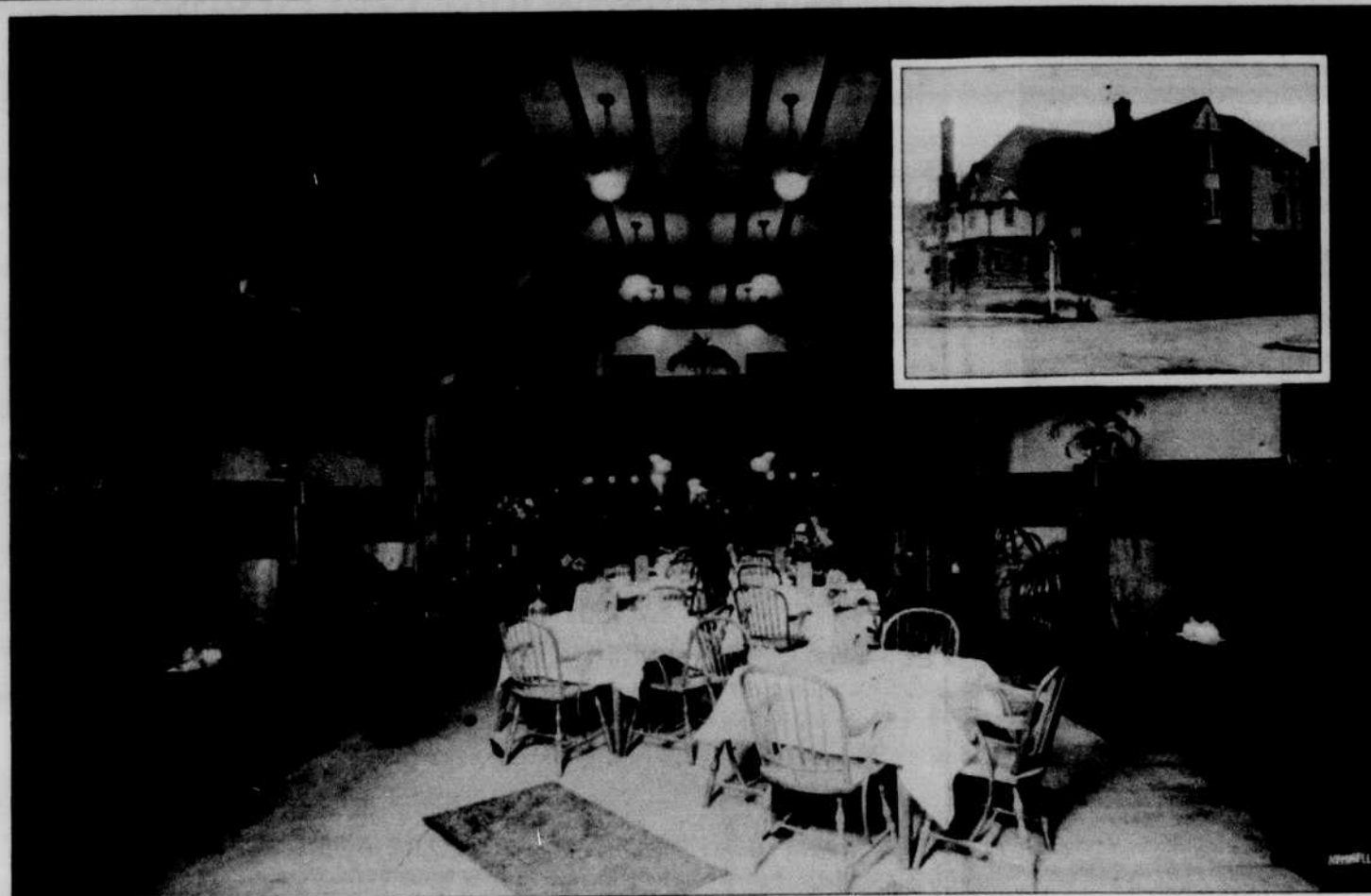
Archives Photos The original College Side Inn, located where the University Bookstore now stands, was a soda fountain that served alcohol and had a dance floor. The Sigma Chi house (inset), rebuilt in 1929, was located at 13th Avenue and Alder Street.