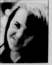
FROG sidewalk vendor

"Local color. It's truly the culture of the campus. It's a great cross-culture."