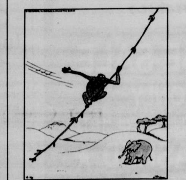
He had seen Tanzania, and most of Mozambique was already behind him. There was no mistake. Chippy had done what most chimps only dream about: He had caught the Perfect Vine.