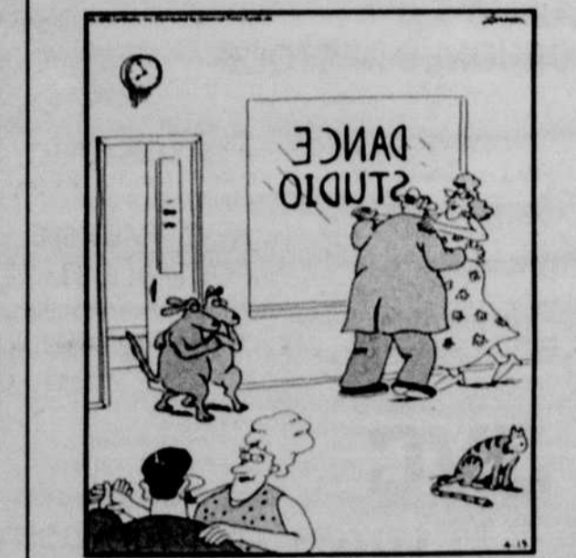
As witnesses later recalled, two small dogs just waltzed into the place, grabbed the cat, and waltzed out.