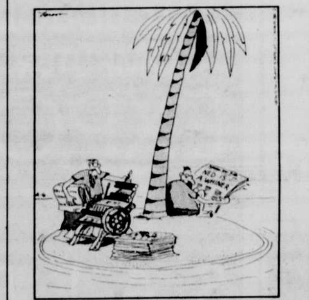
Hot off the press, the very first edition of the Desert Island Times caused the newspaper to quickly fold.