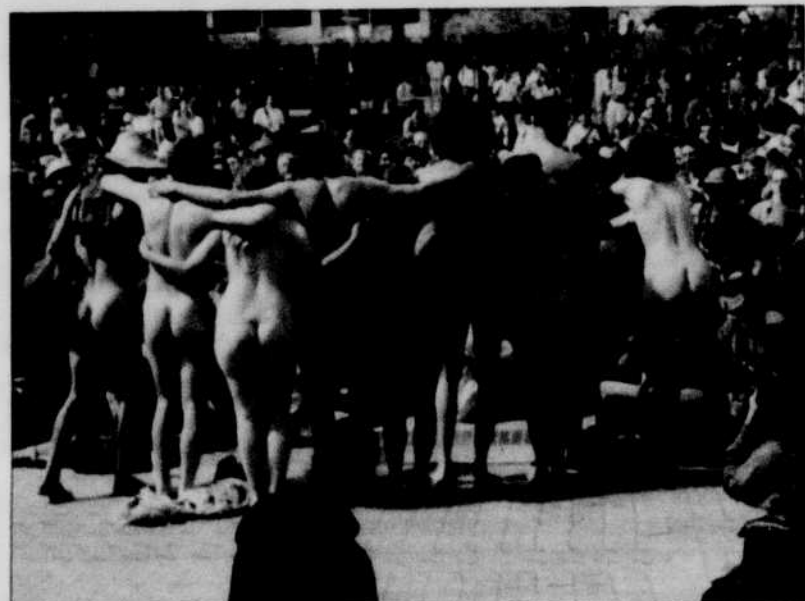
Baked in — U. of California, Berkeley, students celebrate nudity and freedom of expression. Berkeley's famous (and overexposed) "Baked Guy" is at the microphone.

The four Grand Prize winners will each receive $1,000 from U. for the best photo contest entry submitted in four categories: news, sports, campus life/lifestyles and entertainment.