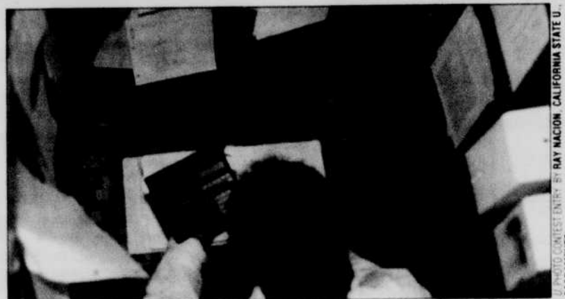
Ultra Cramming — California State U., Sacramento, student commandeers a private stall to cram for engineering final.