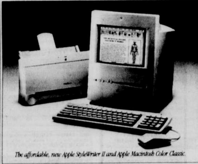
The affordable, new Apple StyleWriter II and Apple Macintosh Color Classic.

Introducing the most affordable color Macintosh® system ever. The new Macintosh Color Classic® computer gives you a sharp, bright Sony Trinitron display, built-in audio, file sharing, networking and more. And the new, compact Apple StyleWriter® II printer delivers stunning, laser-quality output