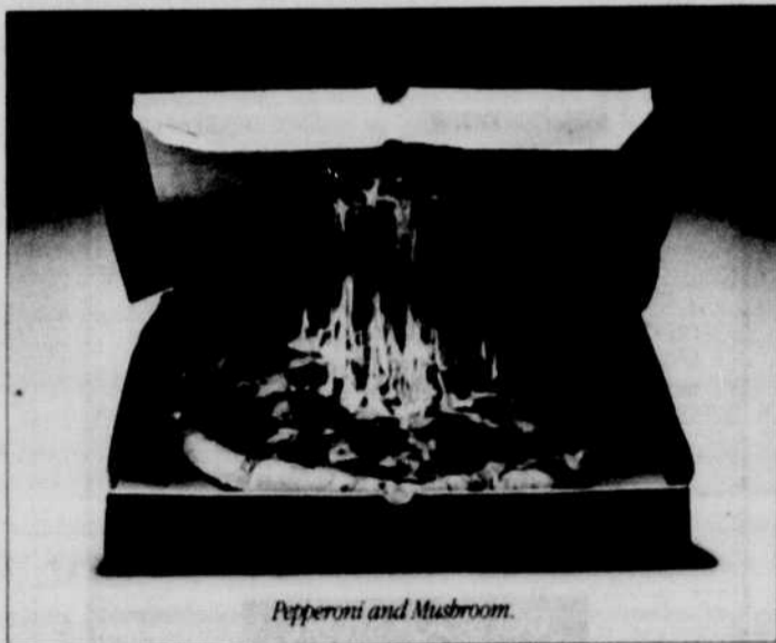
Pepperoni and Mushroom.

Two inexpensive combinations that will help you survive even the most grueling term.