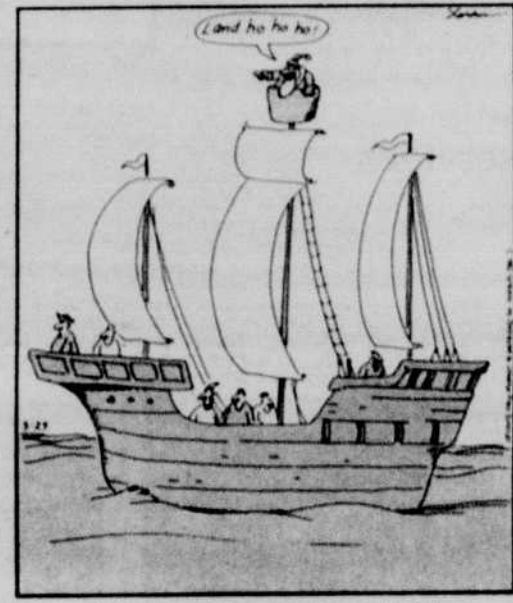
How Santa first came to the New World