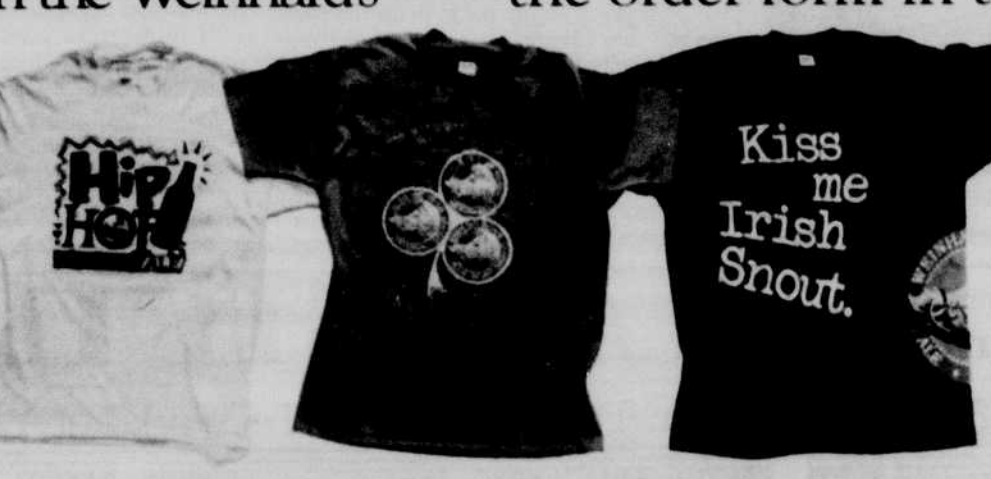
i's in your hands. Purchase these all-cotton, genuine Blue Boar Brand T-shirts and the pig will live out his life happily igging for truffles. Available in XL to fit everybody. (Shown left to right, "Hip Hops", "Green Shamrock", "Irish Snout