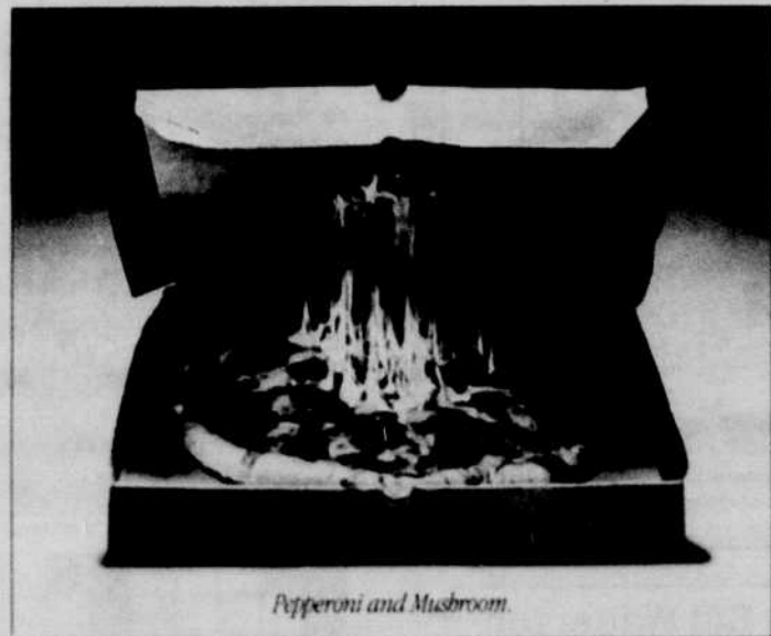
Pepperoni and Mushroom.

Two inexpensive combinations that will help you survive even the most grueling term.