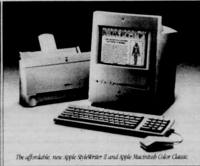
The affordable, new Apple StyleWriter II and Apple Macintosh Color Classic.

Introducing the most affordable color Macintosh® system ever. The new Macintosh Color Classic® computer gives you a sharp, bright Sony Trinitron display, built-in audio, file sharing, networking and more. And the new, compact Apple® StyleWriter® II printer delivers stunning, laser-quality output