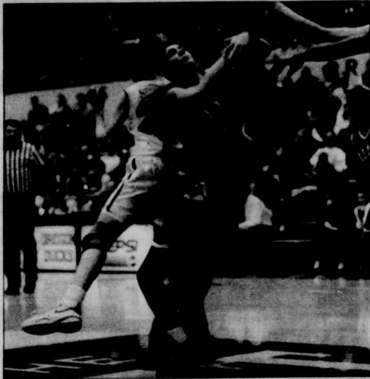
Arizona State players fight for the ball in the Sun Devils' 77-63 win over Oregon Thursday at McArthur Court.

The Sun Devils opened the game with a 9-2 run and they did not relinquish it all night. Arizona State led by as many as 12 points in the opening half, before the Ducks cut the lead to 30-26 with 2:02 remaining in the half. Arizona State finished the