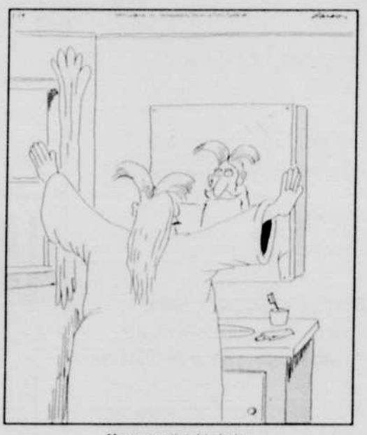
Moses parting his hair