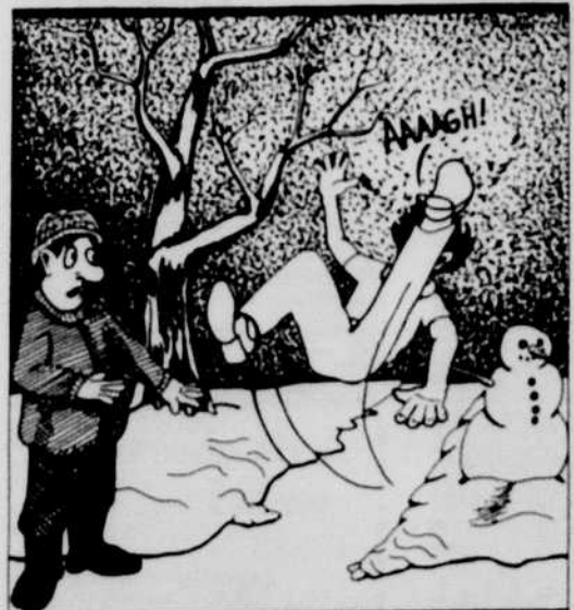
TRY TO GUESS WHICH STUDENT JUST TRANSFERRED FROM SUNNY SOUTHERN CALIFORNIA.