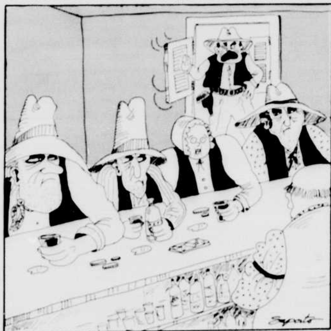
"Any of you strangers seen a thievin' yella coward, calls himself Baby Face Barkley?"