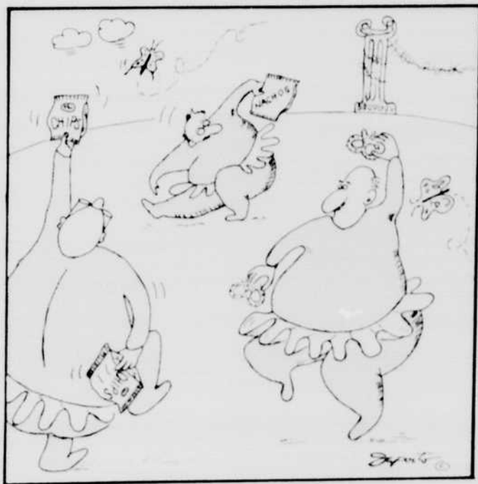
Dance of the snack vendors.