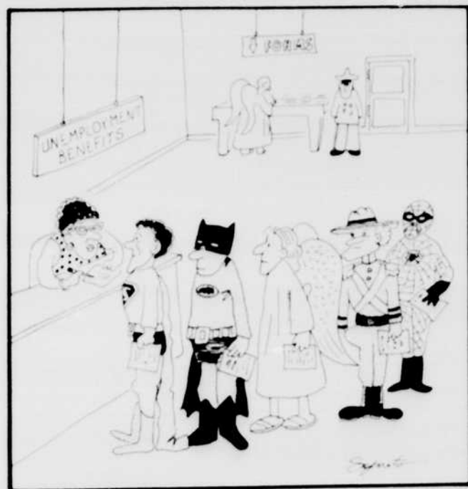
When all evil is finally conquered.