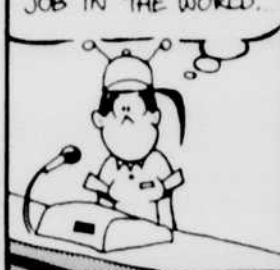
ATLEAST IM MEETING PEOPLE... INTERESTING PEOPLE.. THE ORDINARY PEOPLE.. THE MASSES