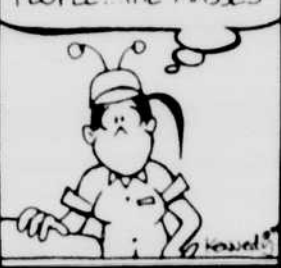
EVERYDAY I CAN DISCOVER THE JOY OF MIXING WITH THE EVERYDAY FOLK ...