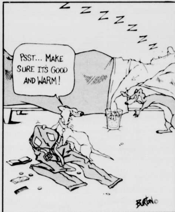
The real reason people don't like ferrets.