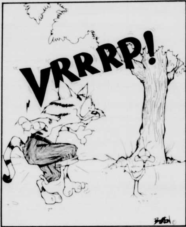
Why cats don't wear corduroys!