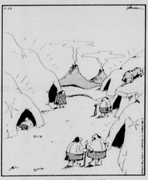
"One good thing about living in this age — all the caves are brand new."