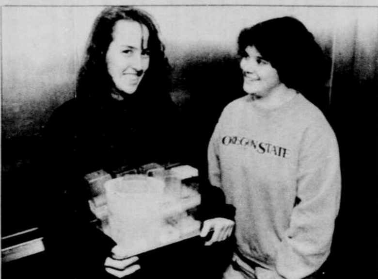
ELEVATOR CRUISING - The way to meet that one special guy.

MOO U - As OSU remembers the Class of '68.