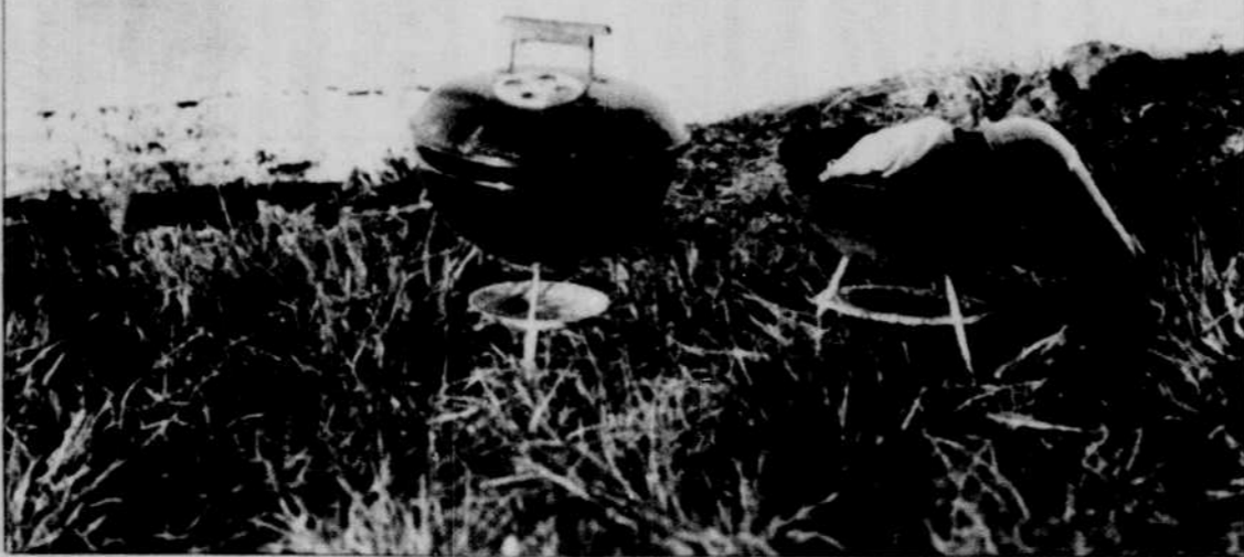
BEEFOLOGY - The cutting edge of meat science, but you can only experiment with 'em so long.