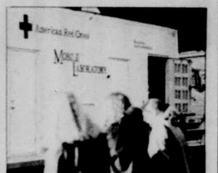
BLOOD LAB - Anxious OSU students await the results of the annual anthrax testing.

DEPT. OF FISHERIES & WILDLIFE SEMINAR GRANT FEIST CONTROL OF SEX IN SALMON NOV 11 NASH 206 WEDNESDAY 1530-1700