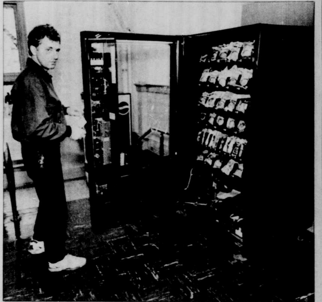
IT'S CUDILISCIOUS™ - A local vendor restocks the cud machine, a campus favorite.

OSU are hats are off to you, Beavers, Beavers, fighters through and through. We'll cheer throughout the land, We'll root for every plan, That's made for 'ol OSU.