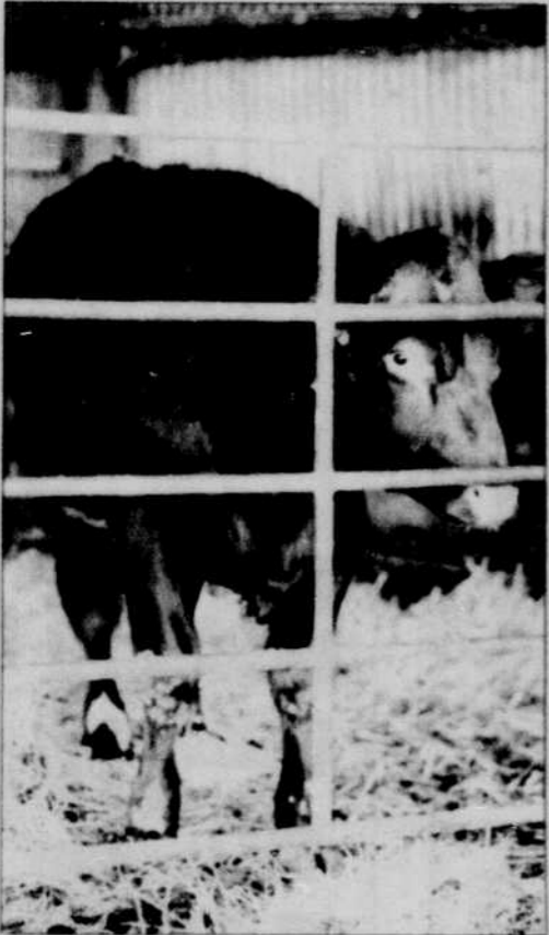
COW - Homecoming King sez, "It's no bull, I'm a stud," shortly before serving millions at McDonald's.