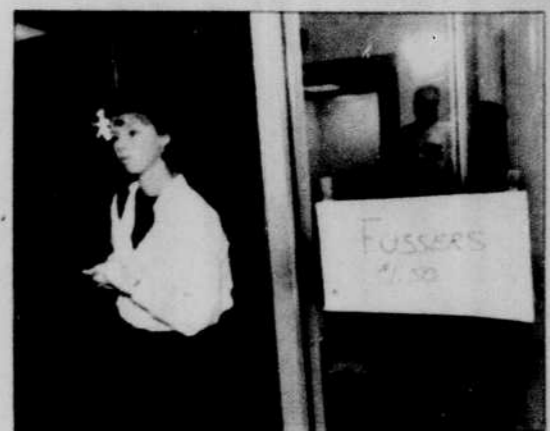
FUSSERS $1.50 - Another satisfied customer.