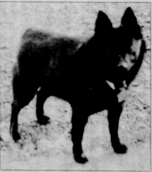
Benny Beaver sings the OSU fight song

OSU are hats are off to you, Beavers, Beavers, fighters through and through. We'll cheer throughout the land, We'll root for every plan, That's made for 'ol OSU.