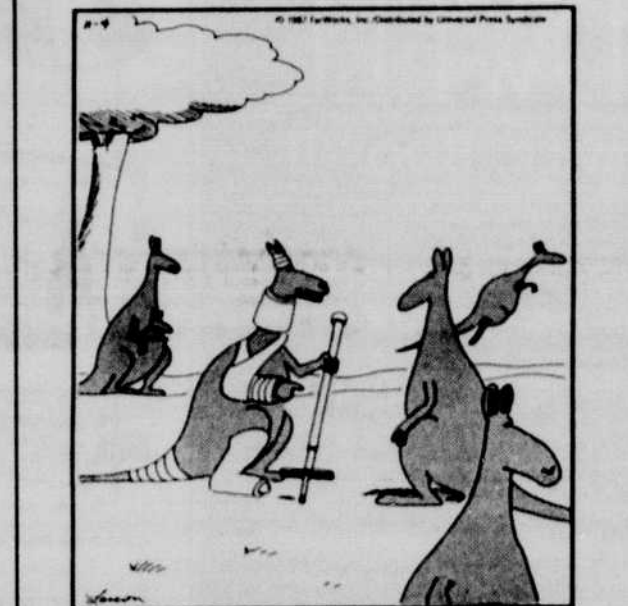
"Well, if I'm lucky, I should be able to get off this thing in about six more weeks."