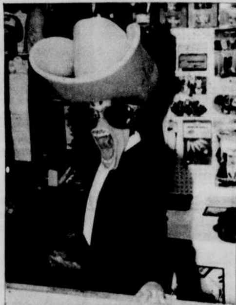
"Aaaaaahhhhhhh" is the response this mask will probably evoke at Halloween parties.