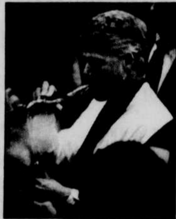
Bill Clinton waded into the crowd after speaking in McArthur Court Thursday. He also took time to blow a few notes on the sax.