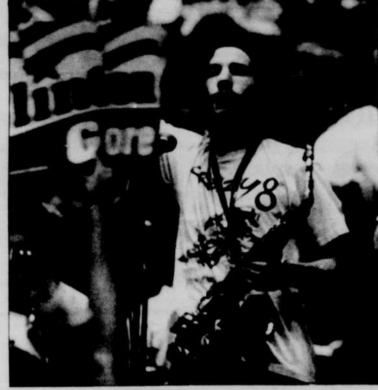
A Crazy 8s member warms up the crowd before Bill Clinton comes out to tell how he'll put more bread on voters' tables.

Obviously, the 10,000 people inside - and all those left outside - of Mac Court didn't come to see the Crazy 8s. But where were they when Clinton was here during May for the primaries? Same man, same