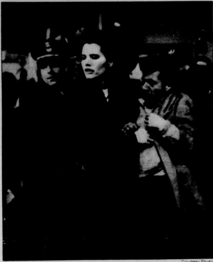
News reporter Gale Gayley (Geena Davis) manhandles Bernie LaPlante (Dustin Hoffman) through a crowd in the new comedy Hero.

However, Bernie's small slip-up in personal ethics ends up to be international news when Gale, who's been in desperate need of a "noble" and "inspirational" story, sensationalizes him into a mystery hero: "The Angel of Flight 104." Her network even comes up with a million dollar reward if the "mystery guy" agrees to come forward and give an interview.