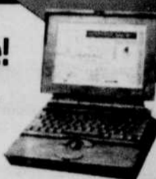
The PowerBook laptop is the desktop Macintosh for mobile people.

We've outgrown our home, but rather than move our store to a larger, less familiar location, we're expanding and remodeling our storefront to face Olive Street. We're very excited about these changes, but our inventory is in the way of construction, so we're holding our Semi-annual Demo Clearance one month earlier. If you don't mind a little dust, you can get the best deals of the year from Eugene's only full-service, exclusively Macintosh® computer dealership. Don't dress up, but do hurry down for best selection.