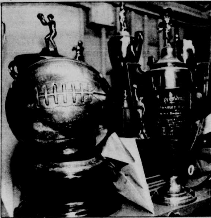
The University archives is also home to a collection of various sporting trophies earned over the years by Ducks.