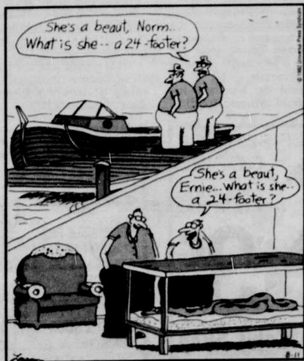
Where the respective worlds of boating and herpetology converge.